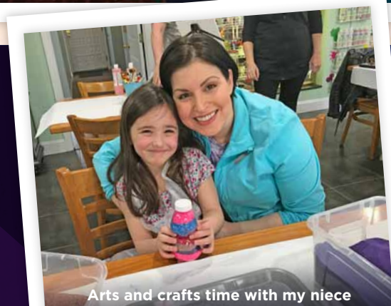
Arts and crafts time with my niece