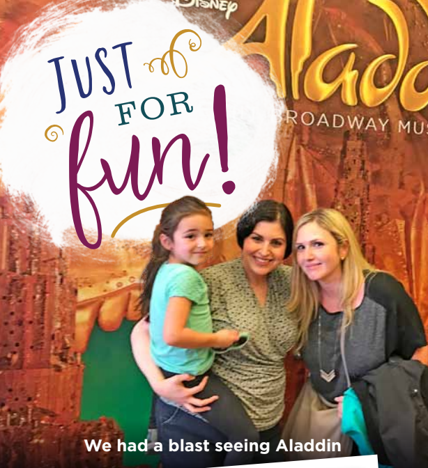
We had a blast seeing Aladdin