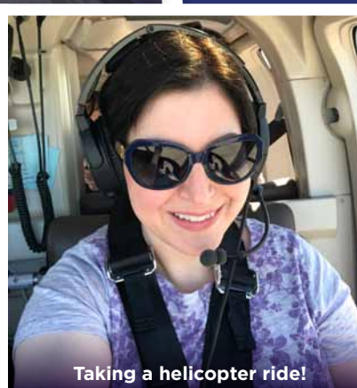
Taking a helicopter ride!