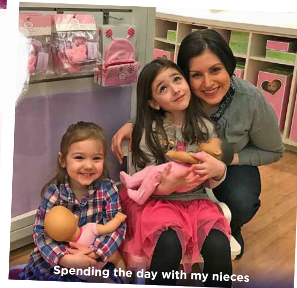
Spending the day with my nieces