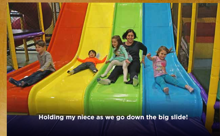
Holding my niece as we go down the big slide!