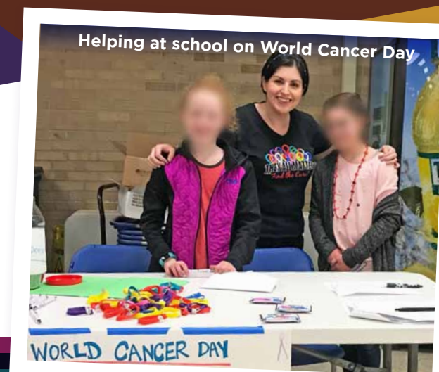
Helping at school on World Cancer Day

Being a teacher has given me years to learn about caring for children and to figure out the kind of parent I will be one day. I've had over a decade as a teacher to observe all kinds of parents and see how their children are impacted by them, for better or for worse. More than anything, being present and involved—listening when he or she has had a bad day or even helping with homework—matters. It's supporting a child every day so that there is no doubt in his or her mind that I will always be there is what counts.