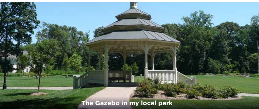
The Gazebo in my local park

away from the best city in the world. Even though it is a small town, it is an incredible place for families. We have multiple parks, activities for children, a tight-knit community, and an excellent school district. I also work just ten minutes from home, which is ideal. This will allow me to pick your child up from school every day and not miss any soccer games, dance classes, or just helping him or her with homework.