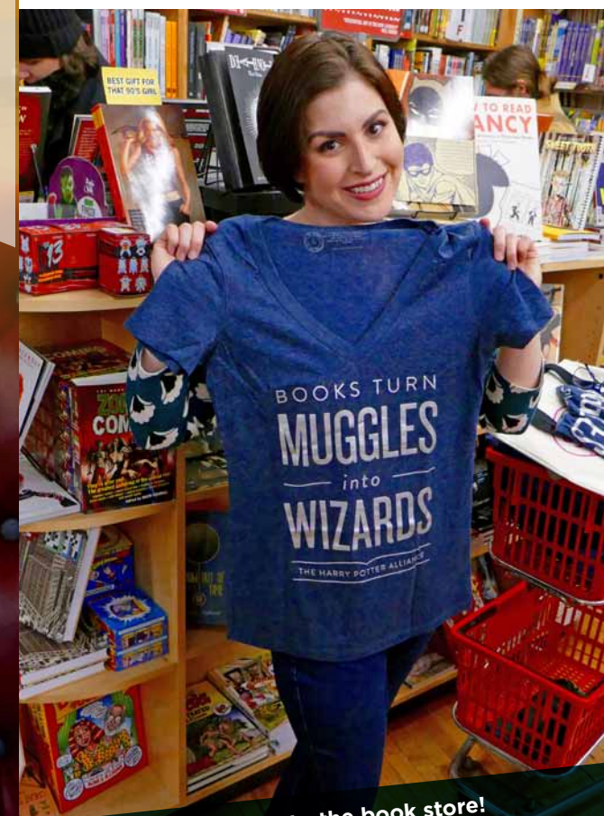
I love going to the book store!

A huge benefit to teaching is that also provides the PERFECT SCHEDULE FOR A PARENT: I will be at work while my child is in school. I have a short 10 minute commute and own a home in an excellent school district. In the beginning, I plan to take time off to bond with your baby. I am grateful to be able to take that time and to have a job that will allow me to spend a great deal of time with a child. The hope of someday being a mother was a large part of why I went into teaching.