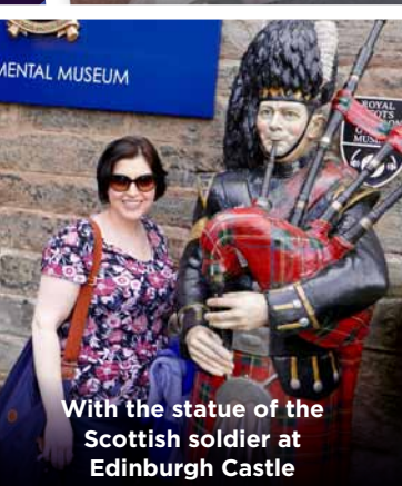
With the statue of the Scottish soldier at Edinburgh Castle