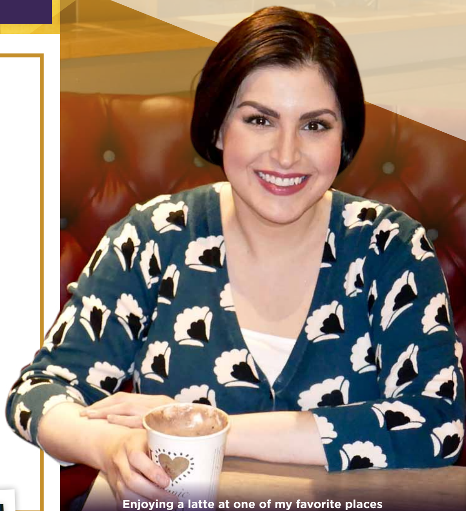
Enjoying a latte at one of my favorite places