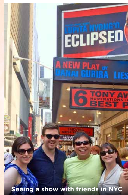
Seeing a show with friends in NYC

IN MY free time, I ♥ GOING TO NEW YORK CITY!