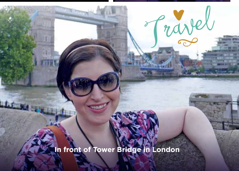
In front of Tower Bridge in London