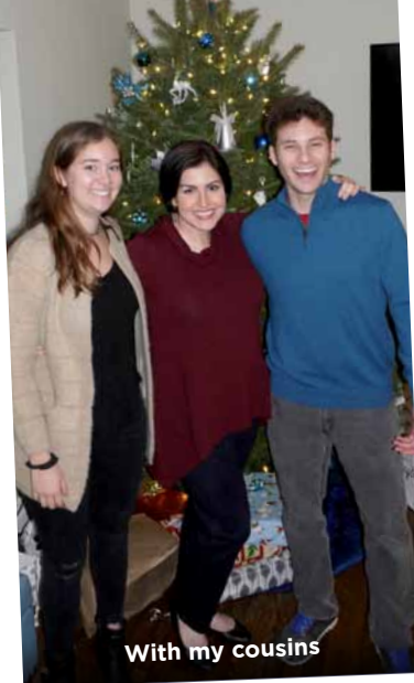
With my cousins