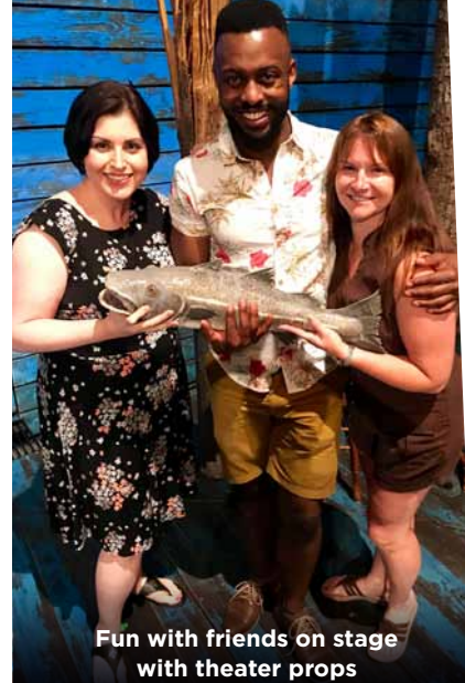
Fun with friends on stage with theater props